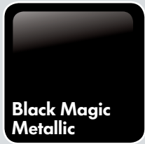
Black Magic Metallic