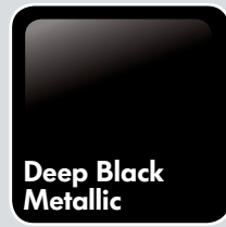
Deep Black Metallic