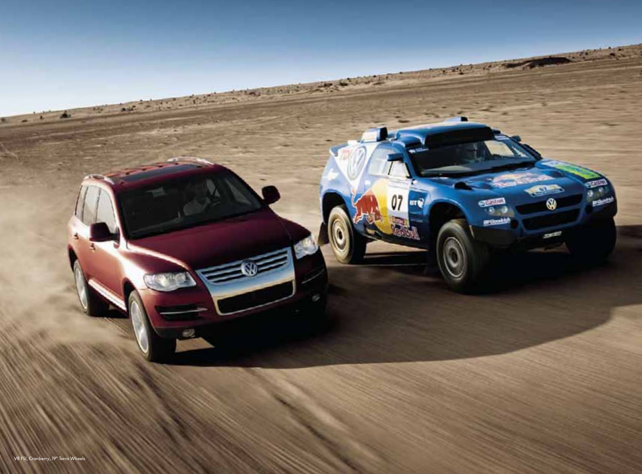
V8 FSI, Cranberry, 19" Terra Wheels