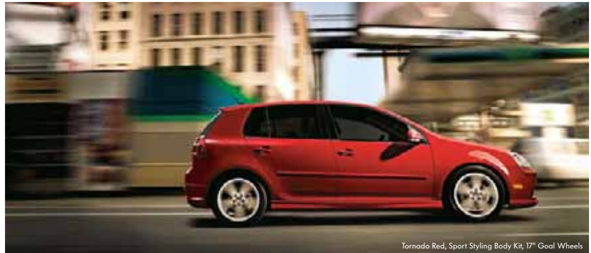
Tornado Red, Sport Styling Body Kit, 17" Goal Wheels

*Manual transmission: 21 city/29 highway mpg. EPA estimates only. Your mileage may vary.