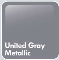
United Gray Metallic