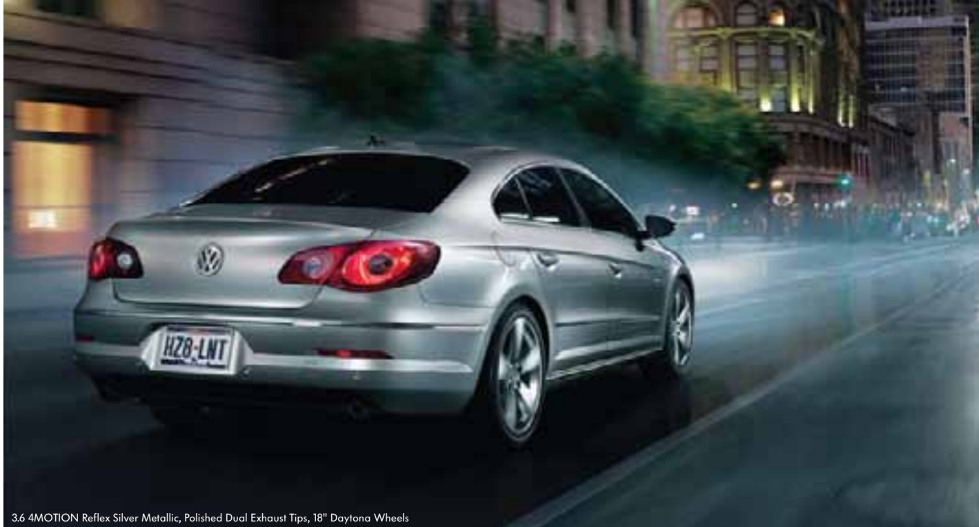
3.6 4MOTION Reflex Silver Metallic, Polished Dual Exhaust Tips, 18" Daytona Wheels