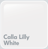
Calla Lilly White