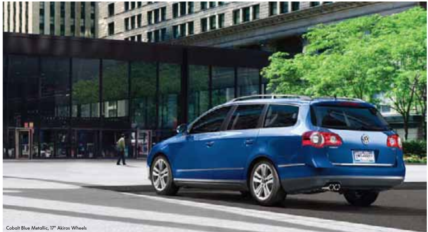
Cobalt Blue Metallic, 17" Akiros Wheels

*2007 and 2008 Kiplinger's Finance "Best in Class" Passat Wagon 2.0T. **Passat offers a brake disc wipe feature, an electronic parking brake with auto hold, and a push start key fob system. ***EPA estimates only. Your mileage may vary. †Government star ratings are part of the National Highway Traffic Safety Administration's (NHTSA's) New Car Assessment program ( www.safercar.gov ).