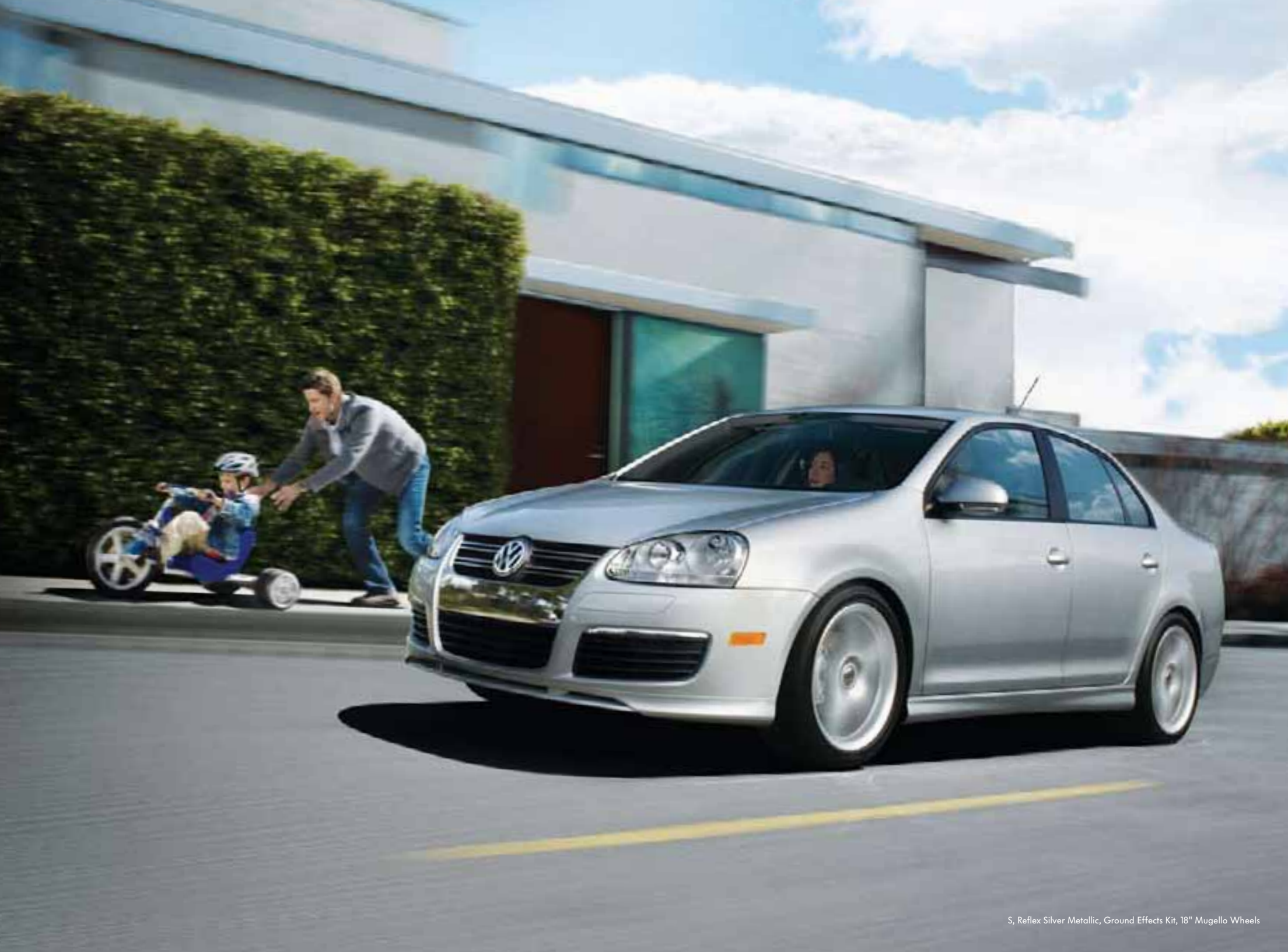
S, Reflex Silver Metallic, Ground Effects Kit, 18" Mugello Wheels