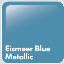
Eismeer Blue Metallic