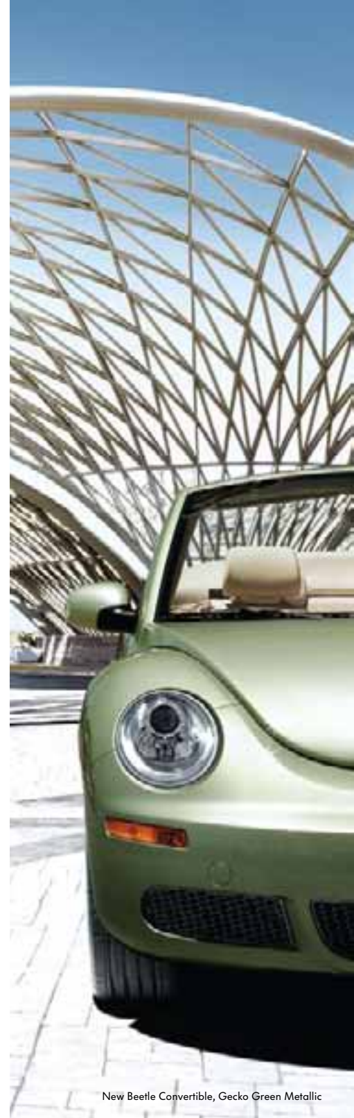
New Beetle Convertible, Gecko Green Metallic