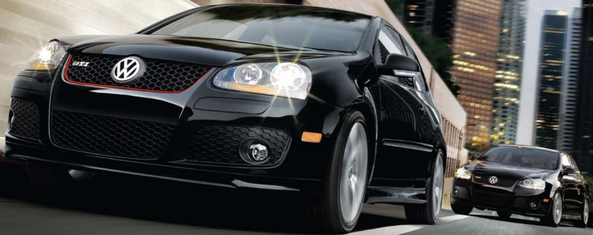
GTI, Black Magic Metallic, GLI Deep Black Metallic. Both cars have Ground Effects Kit, 18" Hufeisen Wheels