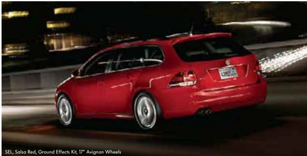
SEL, Salsa Red, Ground Effects Kit, 17" Avignon Wheels

*EPA estimates only. Your mileage may vary. **38 city/44 highway (automatic) real world fuel economy based on AMCI testing. ***Airbags are supplemental restraints only and will not deploy under all crash circumstances. Always use safety belts and seat children only in the rear, using restraint systems, appropriate for their size and age. †Government star ratings are part of the National Highway Traffic Safety Administration's (NHTSA's) New Car Assessment program ( www.safercar.gov ).