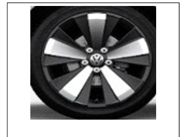
18" Twister Alloy