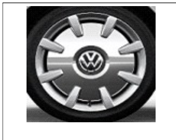
18" Disc Alloy