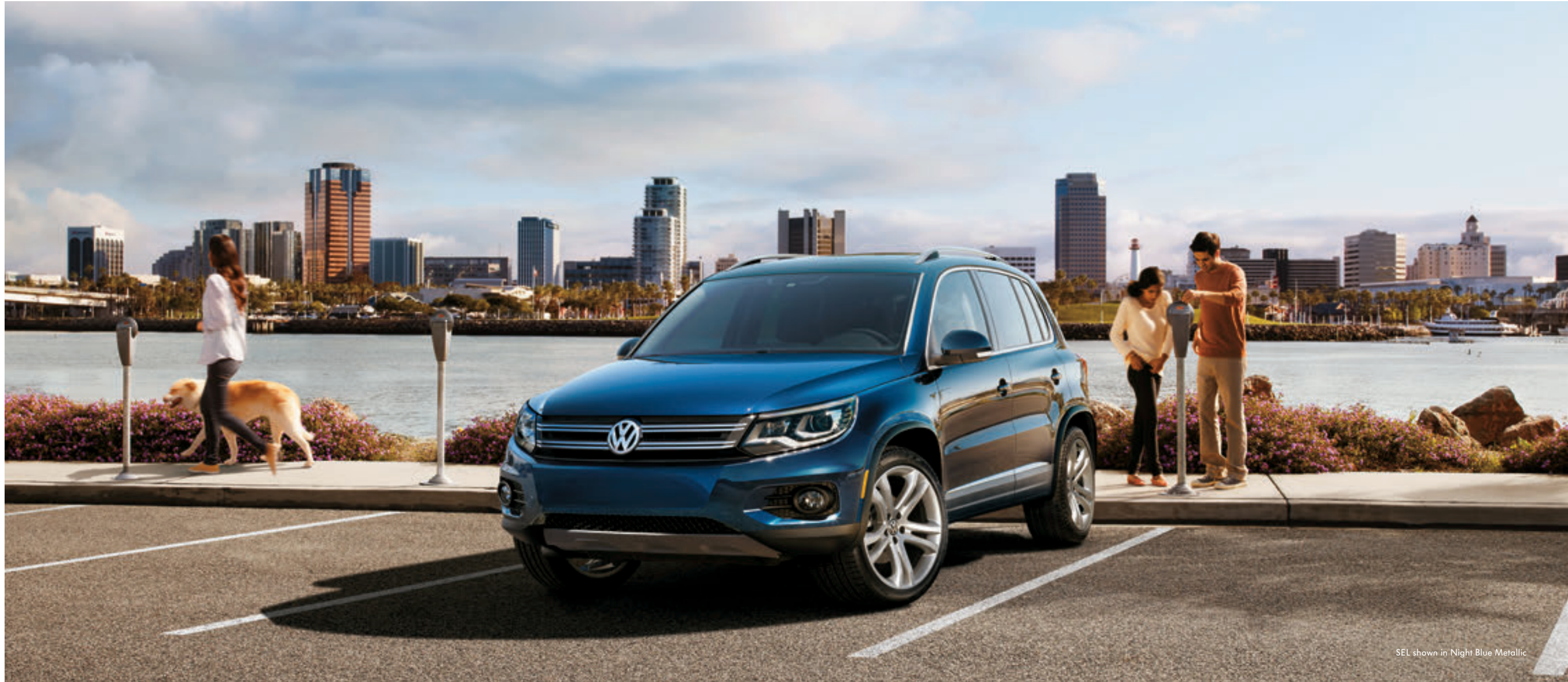
SEL shown in Night Blue Metallic