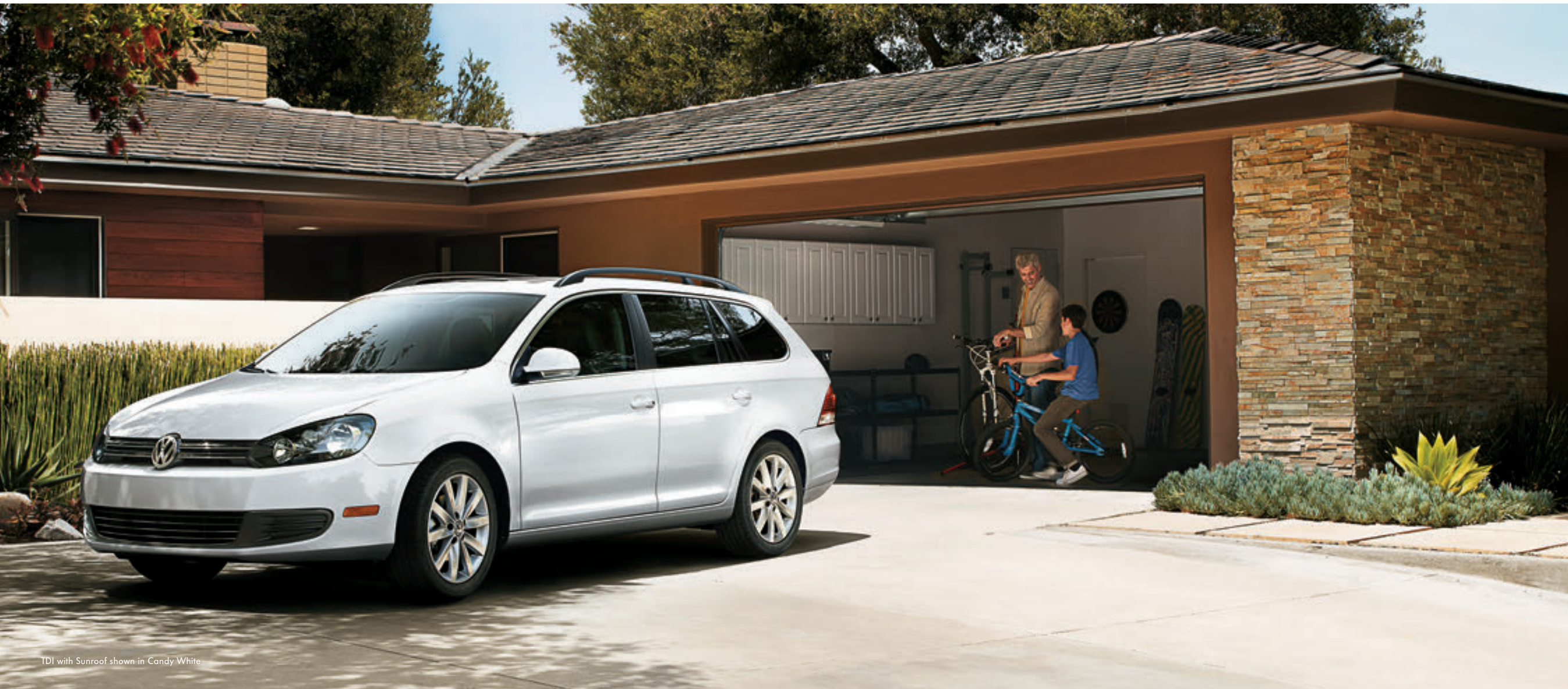
TDI with Sunroof shown in Candy White