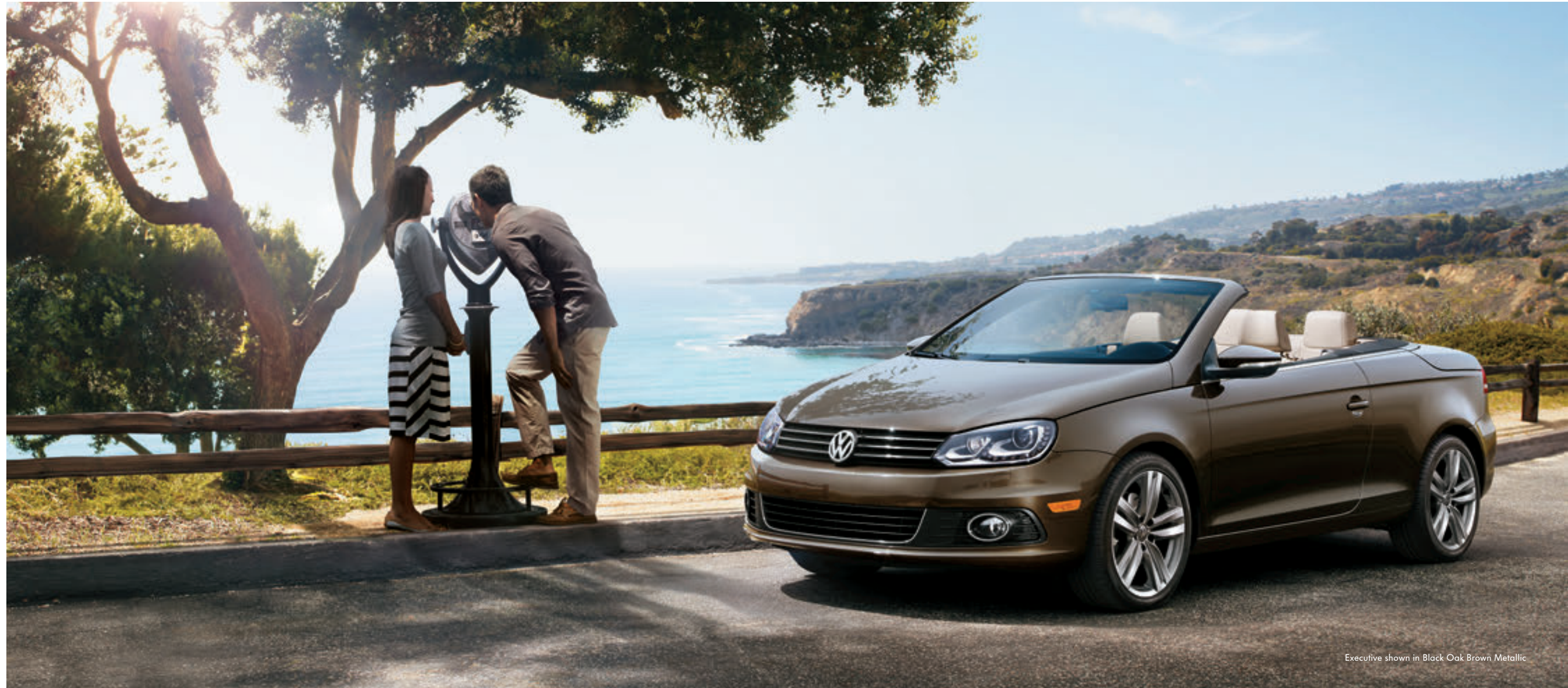
Executive shown in Black Oak Brown Metallic