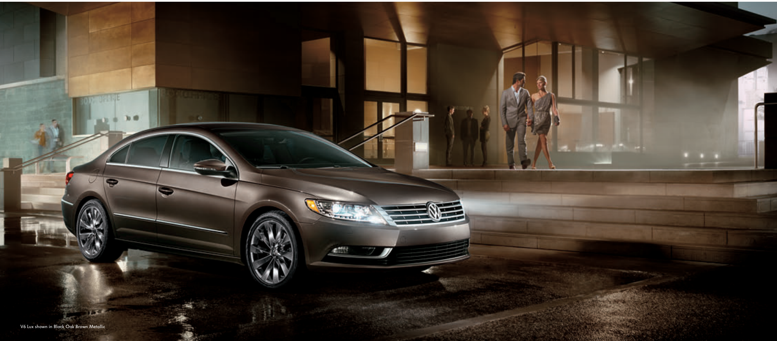
V6 Lux shown in Black Oak Brown Metallic