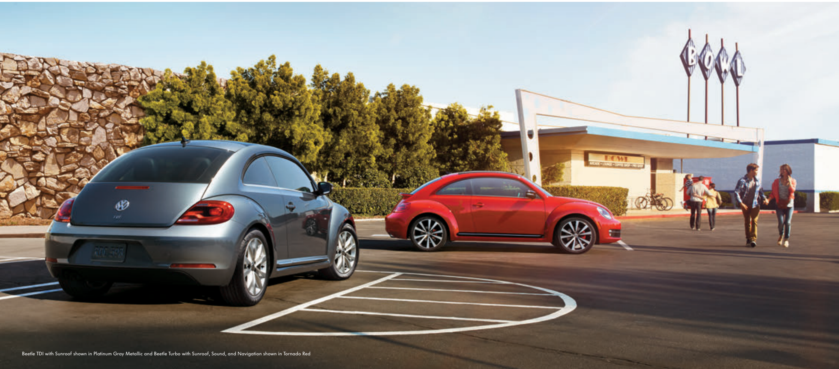
Beetle TDI with Sunroof shown in Platinum Gray Metallic and Beetle Turbo with Sunroof, Sound, and Navigation shown in Tornado Red