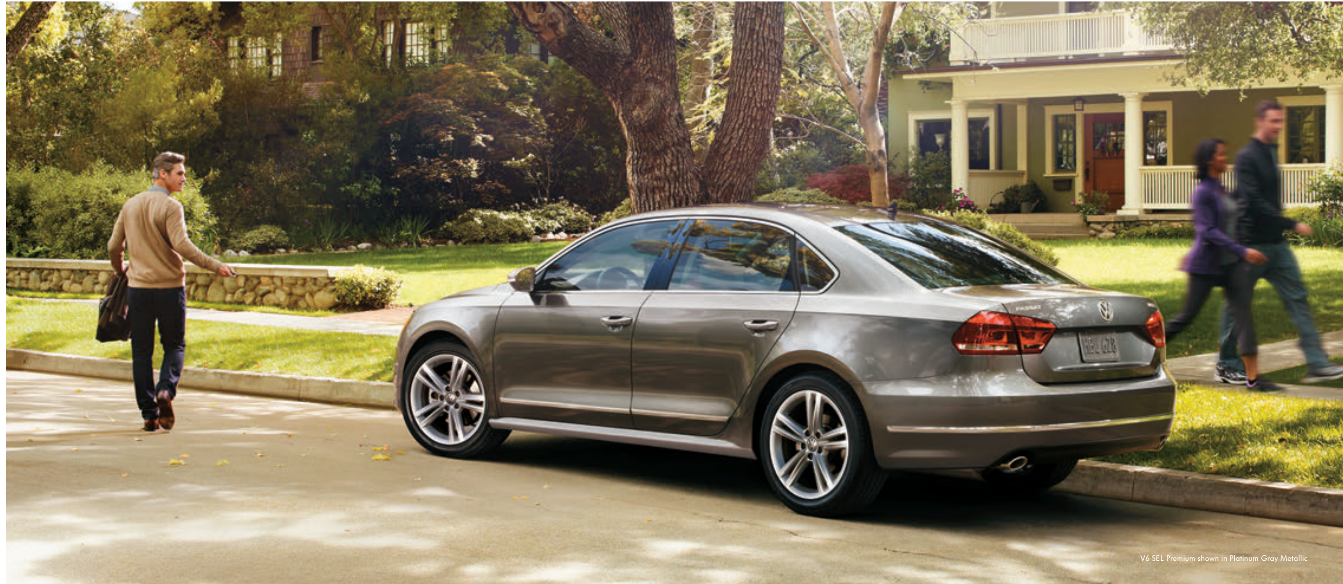
V6 SEL Premium shown in Platinum Gray Metallic