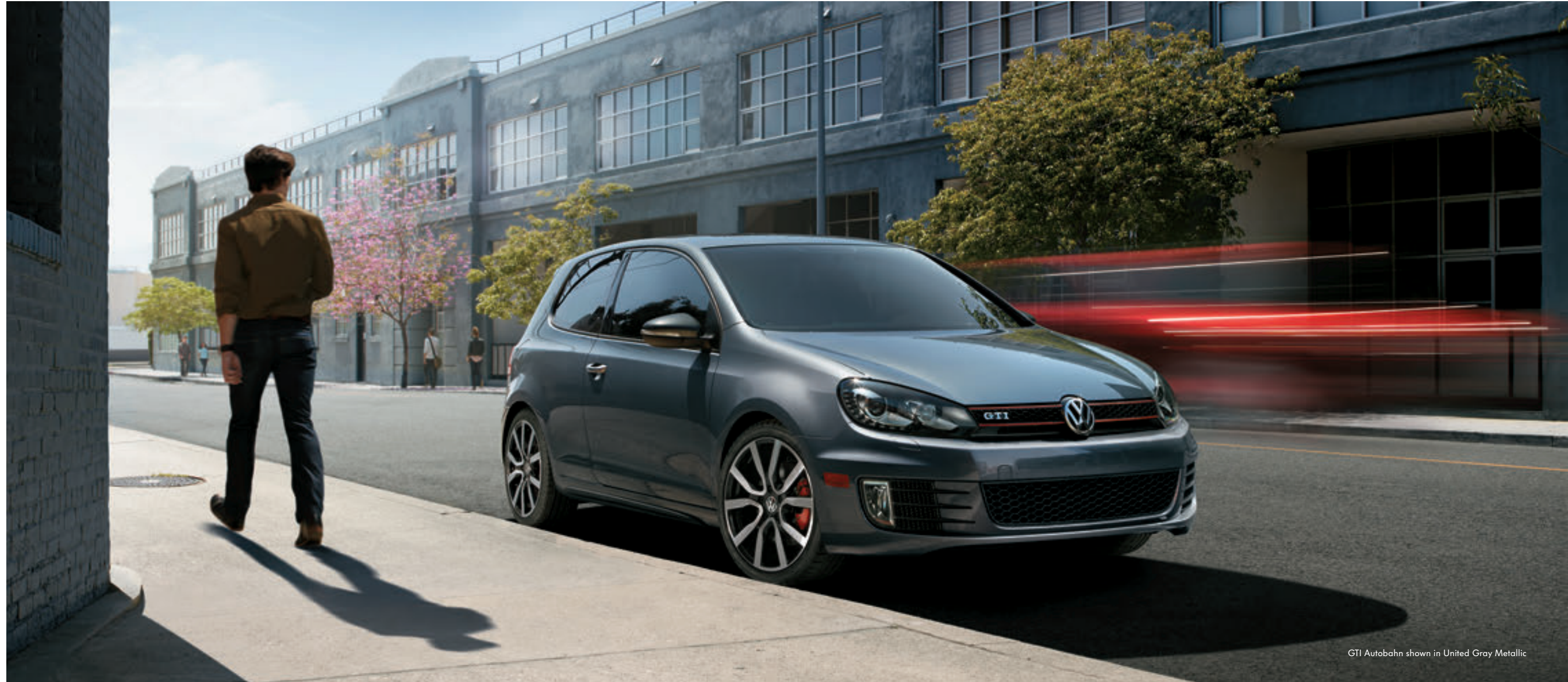
GTI Autobahn shown in United Gray Metallic