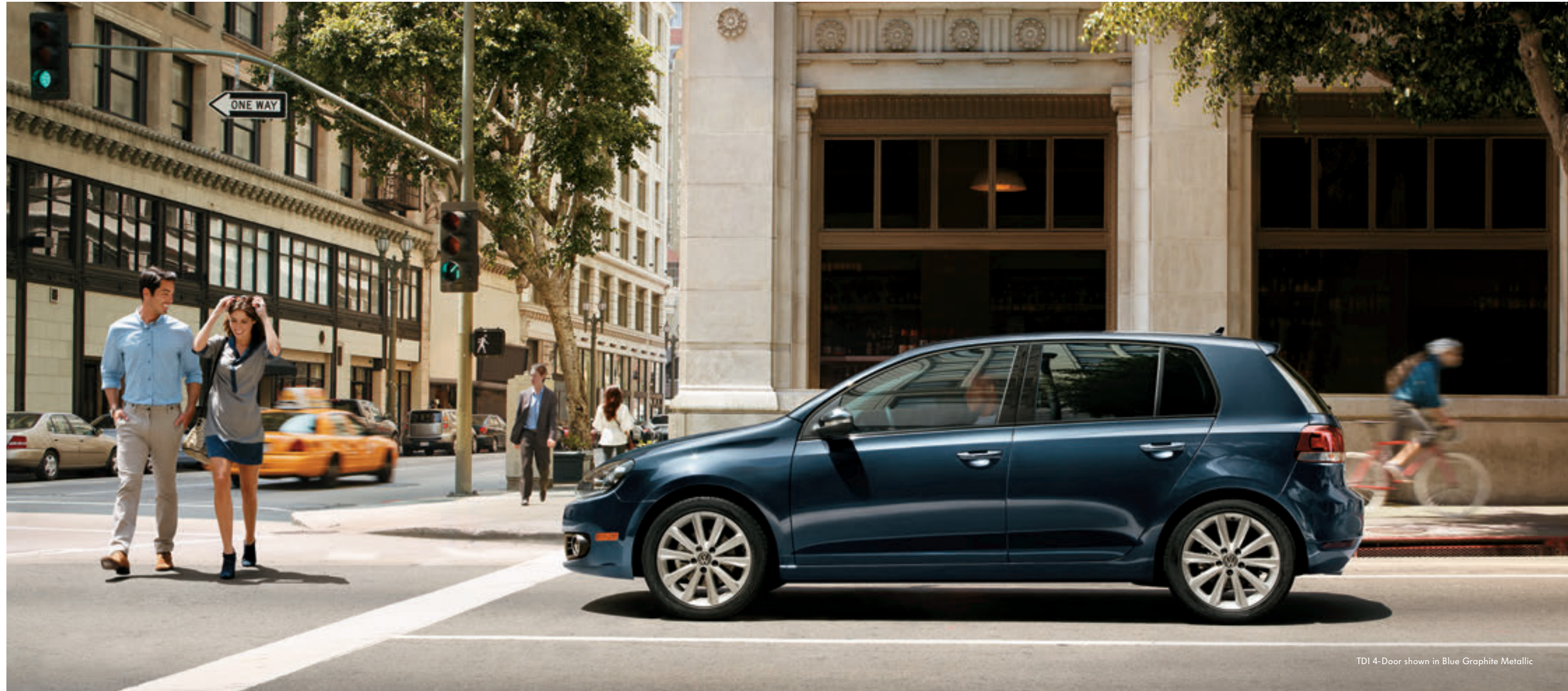
TDI 4-Door shown in Blue Graphite Metallic