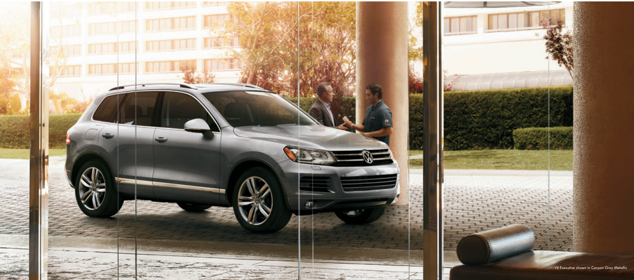
V6 Executive shown in Canyon Gray Metallic