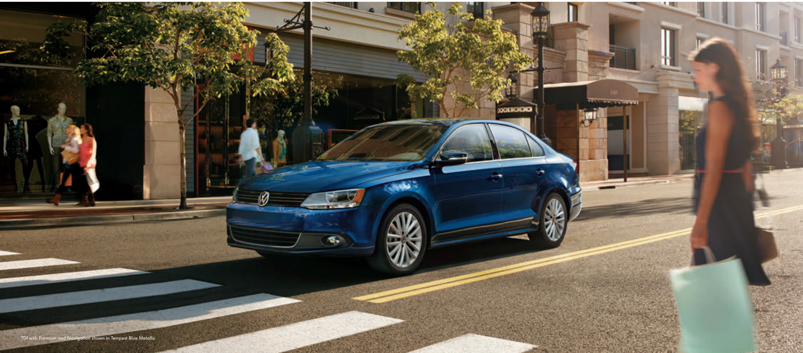
TDI with Premium and Navigation shown in Tempest Blue Metallic