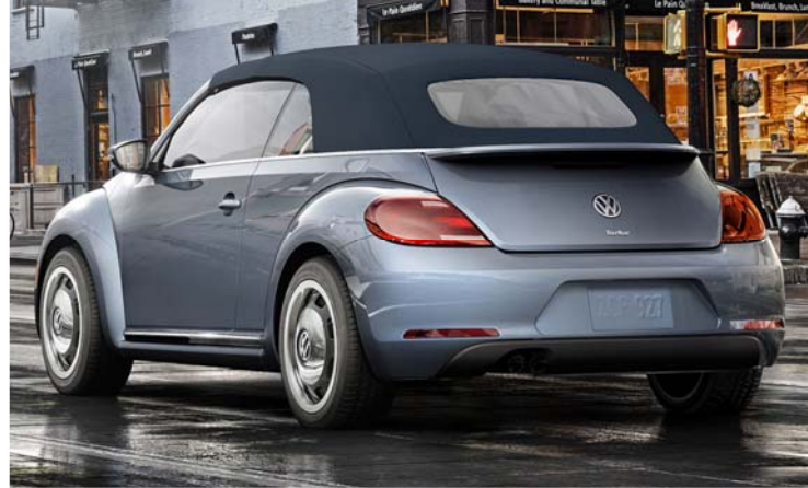
Concept images \ provided \ for \ illustrative \ purposes. \ Some \ features \ shown \ may \ differ \ slightly \ from \ production \ model.