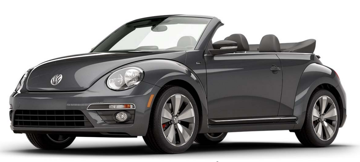
Beetle Convertible R-Line® SE