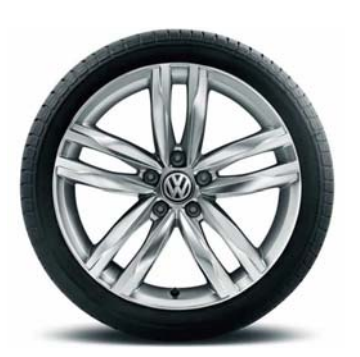
18" Durban wheel