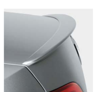
Rear Lip Spoiler