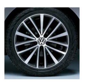
16" Arlington 16" Sedona Black