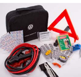
Roadside Assistance Kit