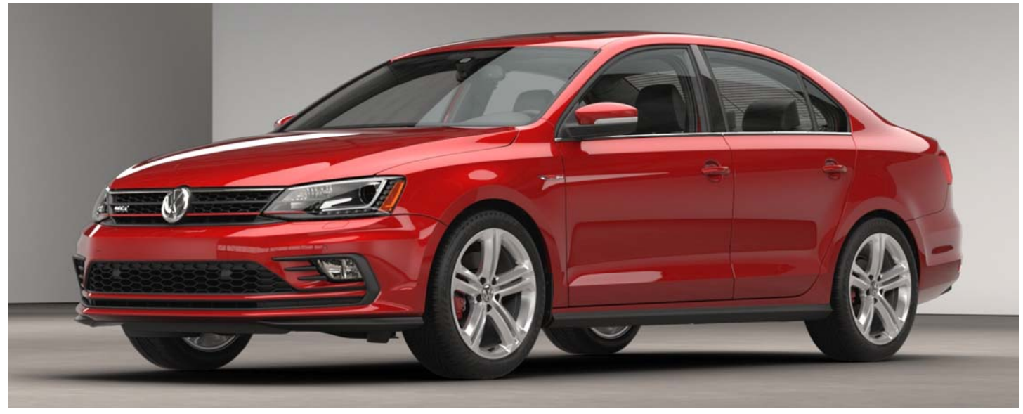
Jetta 2.0T GLI<sup>®</sup> in Tornado Red