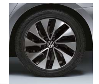
17" Buenos Aires