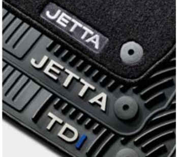
Mojo® & Monster Mats®