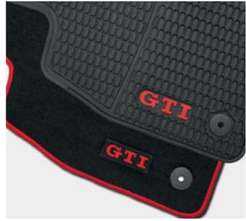
Rubber & Carpeted Mats