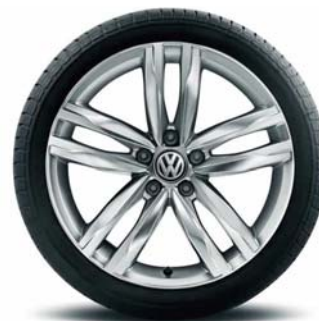
18" Durban wheel