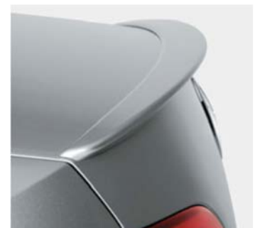
Rear Lip Spoiler