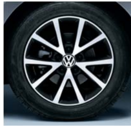
16" Sedona Black