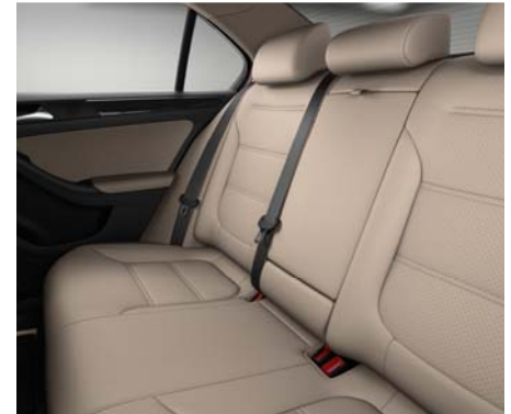
2016 model shown for illustrative purposes. Certain features and appearance will change for 2017.