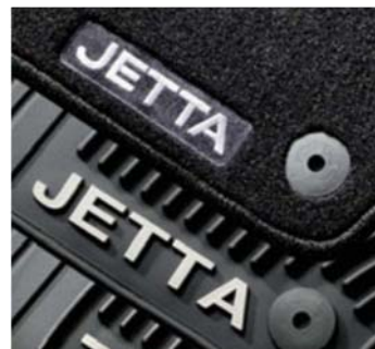
Mojo® &amp; Monster Mats®