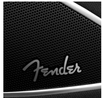
2016 model shown for illustrative purposes. Certain features and appearance will change for 2017.