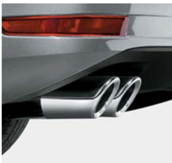
Chrome Exhaust Tips