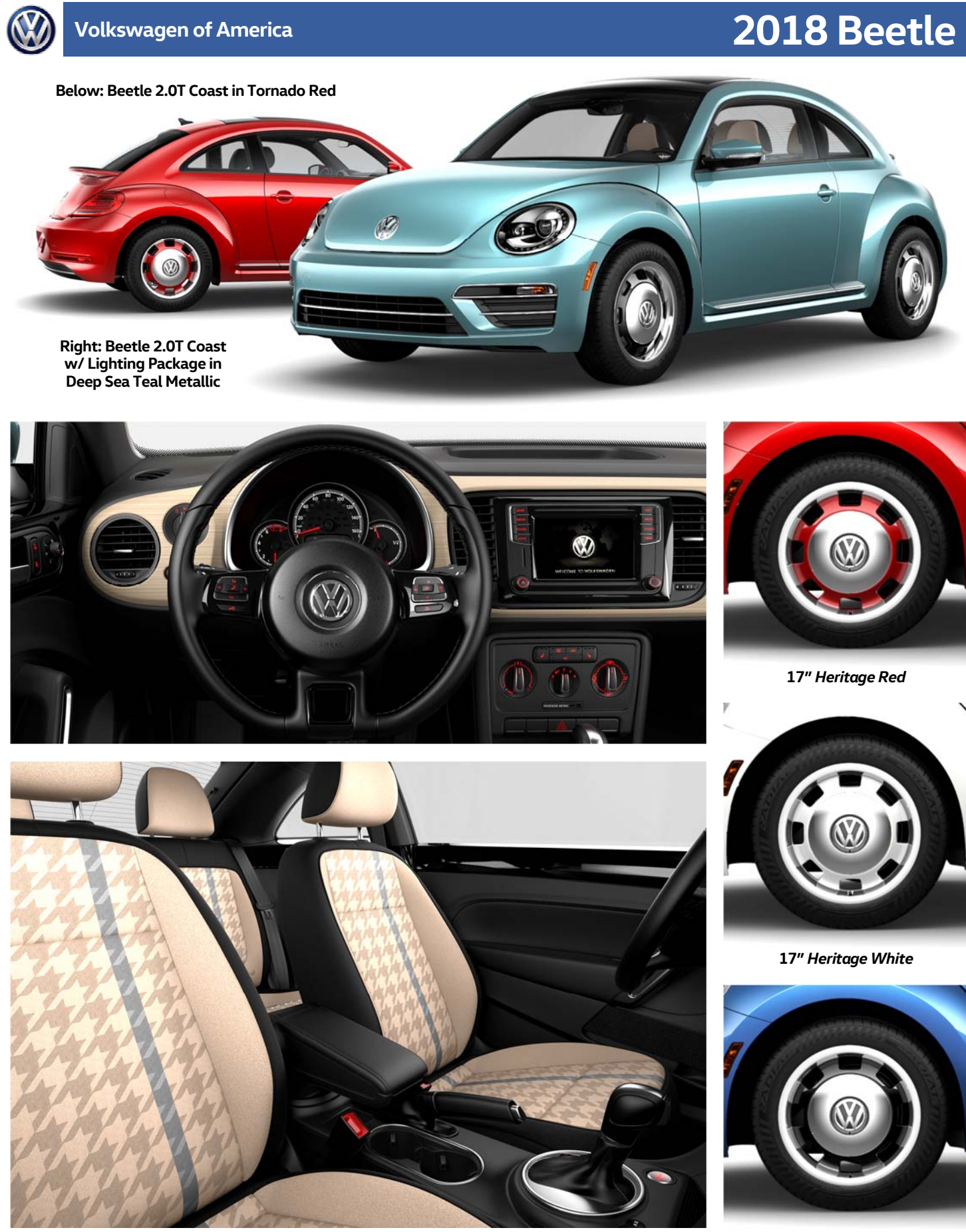
Above & top: Coast interior w/ Pepita two-tone cloth seating surfaces & surfboard-look dashpad