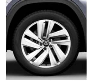
20" Silver 5-spoke (CQ0)