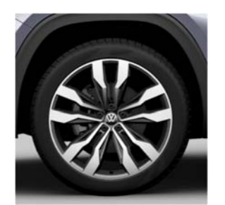
21" Two-Tone Machined (C5J, was Braselton)