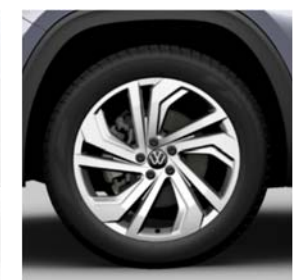
20" Silver 5-spoke (V71)