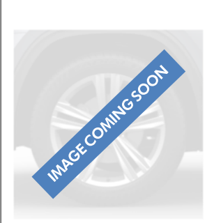
20" Dark Graphite Twin 5-spoke (53V, was Trenton)