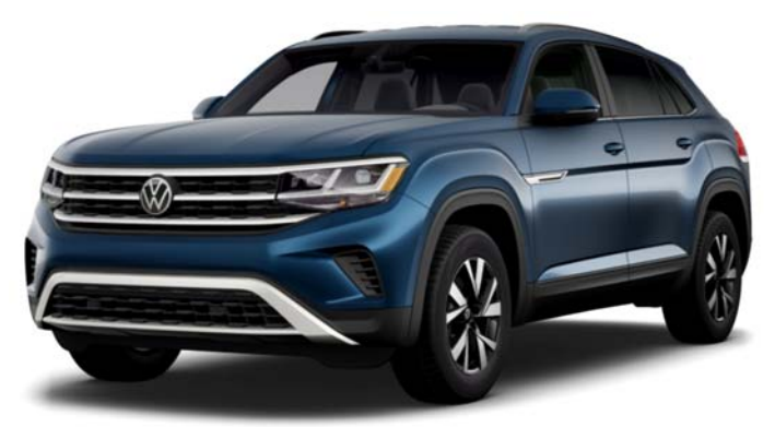
Atlas Cross Sport 2.0T SE w/ 4MOTION^{\circ} in Tourmaline Blue Metallic