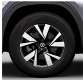
18" 5-spoke Two-Tone Machined (CS1)