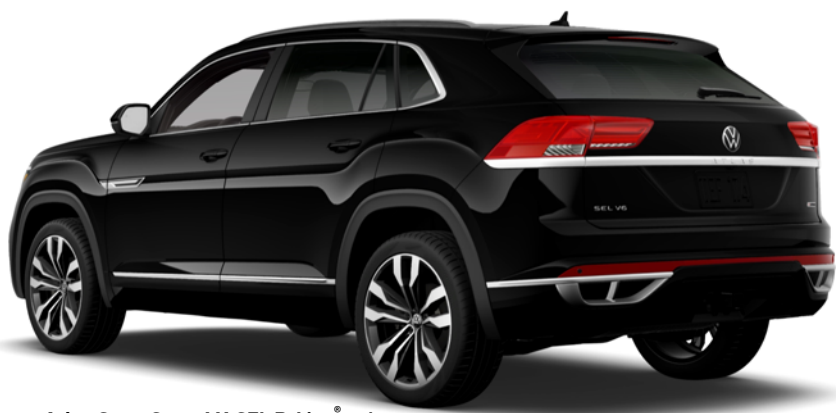
Atlas Cross Sport V6 SEL R-Line® w/ 4MOTION<sup>®</sup> in Deep Black Pearl