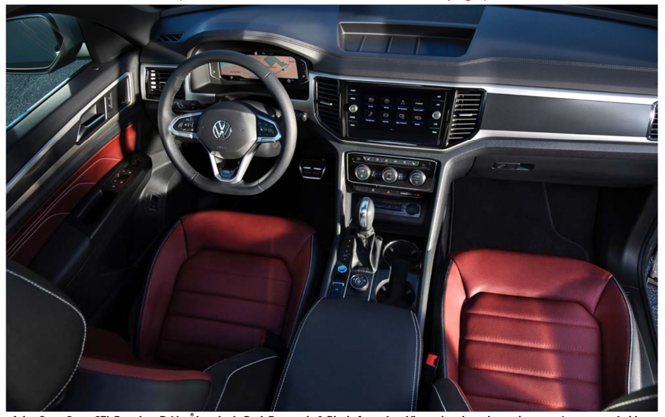
Atlas Cross Sport SEL Premium R-Line® interior in Dark Burgundy & Black, featuring: Vienna Leather trimmed seats w/ contrast stitching, ventilated front Comfort Sport seats, heated rear seat, and Fender® Premium Audio System w/ center speaker & subwoofer