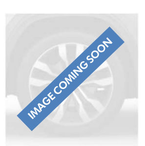
20" 5-spoke Two-Tone Machined (CF0)