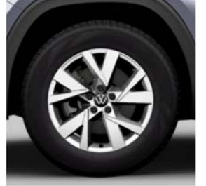
18" 5-spoke (C1Q)