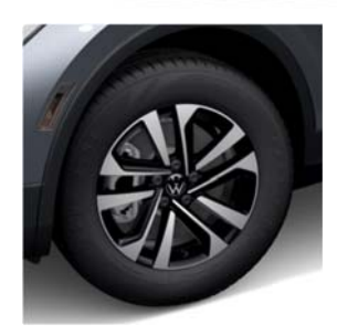
17" two-tone machined twin 5-spoke (CJ7)