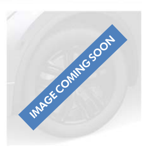
19" black painted twin 5-spoke (V87)