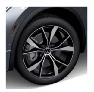
20" two-tone machined (53C)