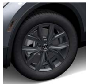
18" dark graphite painted 10-spoke (C2I)